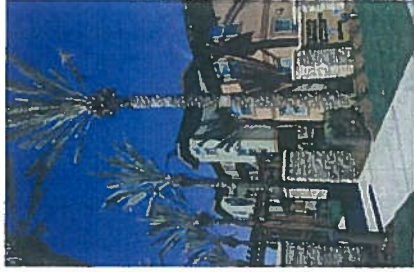
Vineyard Town Homes, Anaheim

Our work has resulted in the production or approval of more than 3,500 affordable rental homes--homes that would not have been possible without the Commission's leadership.