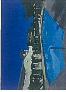
Mendocino, San Clemente